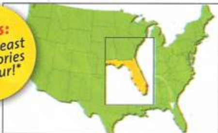
Delray Beach, Florida

Bonus: Burn at least 450 calories per hour!*