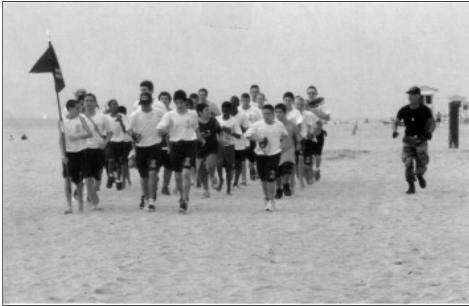
“Health Colonel” puts Team Spruance Sea Cadets through their paces during a boot camp workout on Fort Lauderdale Beach, Fla.