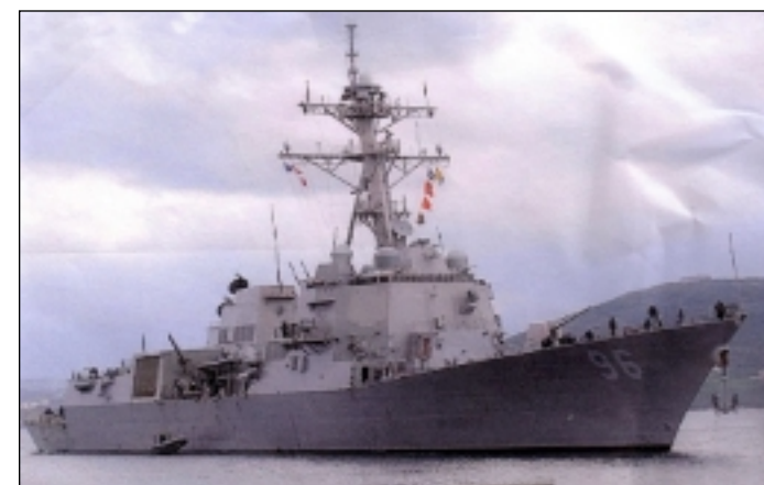
080110-N-0780F-001 Souda Bay, Crete, Greece (Jan. 10, 2008) The Arleigh Burke-class guided missile destroyer USS Bainbridge (DDG 96) arrives at NATO Pier Facility in Souda harbor for a routine port visit. Bainbridge is on a regularly scheduled six-month deployment.